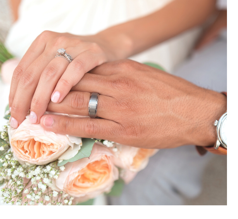
FOREVER CIVIL CEREMONY

When it's the one day you've always looked forward to and you're all about making it extra special. With all the necessities for a legal civil ceremony with some added extras so you can feel pampered and loved on your special day!